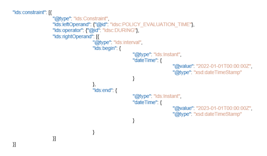
Fig. 3. Interval-based IDSA UPL Condition